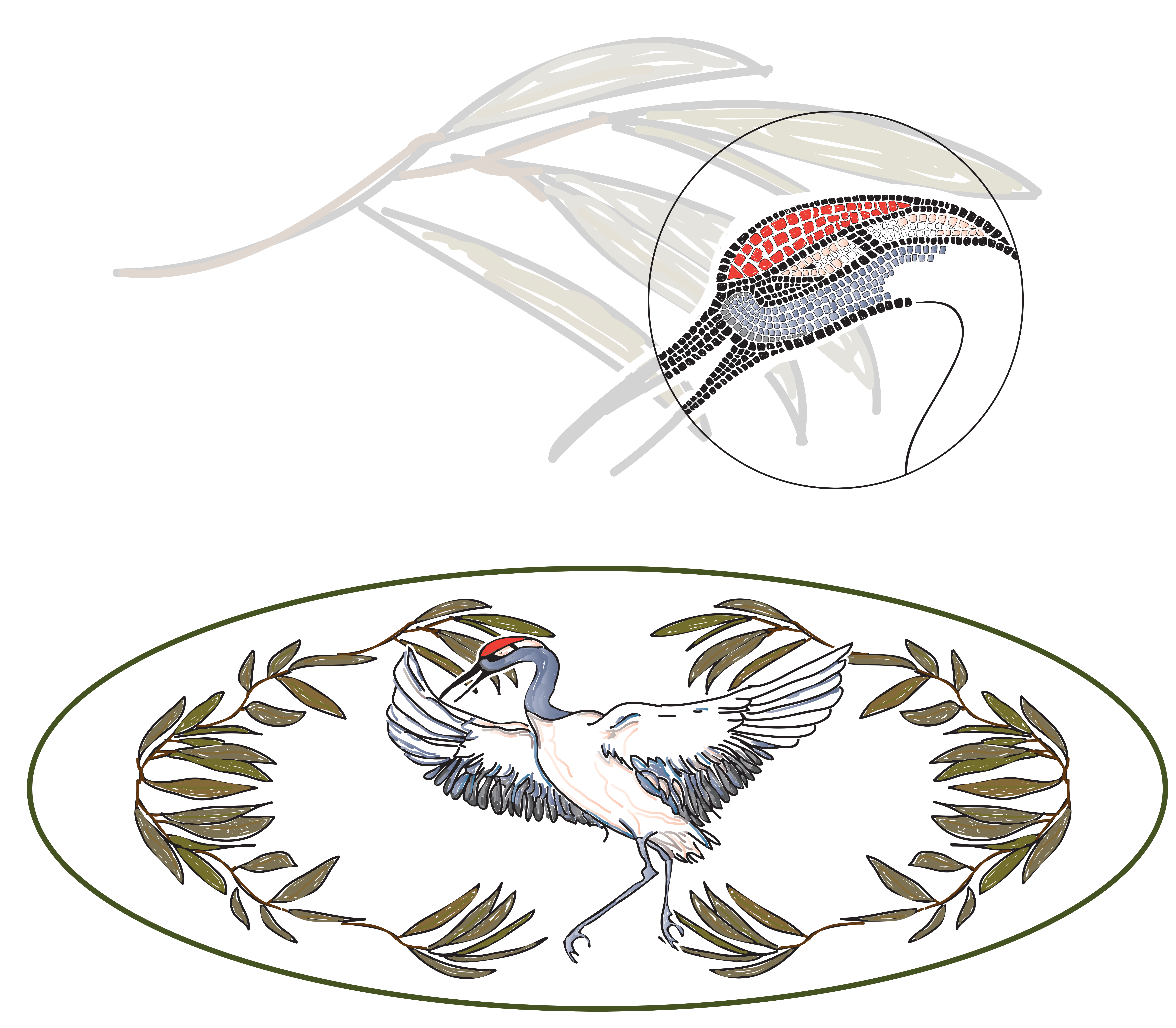
l: 240 cm, h:63 cm (~2,3 sqm)

The mosaic's uniqueness lies in its soft and elegant texture: each tessera, of approximately 1 cm<sup>3</sup> for the background and of 0.5 cm<sup>3</sup> for the figurative subject, is enhanced by the handmade cutting process and by the so-called tessellatum style, of the Greek and Roman tradition.